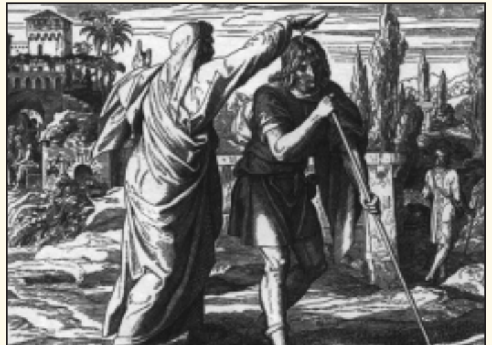
Samuel Anointing Saul (Bible Illustrations, Dover, NY, 2003)

The Common and The Holy. There were many ointments, unguents and creams in Biblical days. Oil was as important in the ancient Middle East as it is today. Oil (mostly olive) was used to cook and make bread. It was mixed with myrrh for worship and sacrifice, for consecration ceremonies and for anointing kings and priests. The Egyptians before them and the Hebrews made serious distinctions between the common and the holy, with strict instructions regarding holy anointing oil. As recorded in Exodus 30, Yahweh (יְהוָה LORD ) gave meticulous orders about all aspects of worship; among them were laws regarding oil (שֶׁמֶן) of the holy (קֹדֶשׁ) anointing (מְשַׁח) ointment. This holy "anointment," made of pure myrrh, cinnamon, cala-